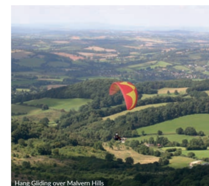
Hang Gliding over Malvern Hills