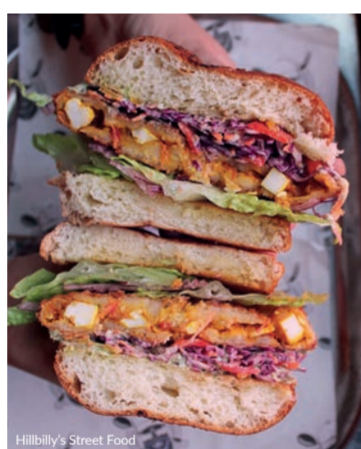
Hillbilly's Street Food