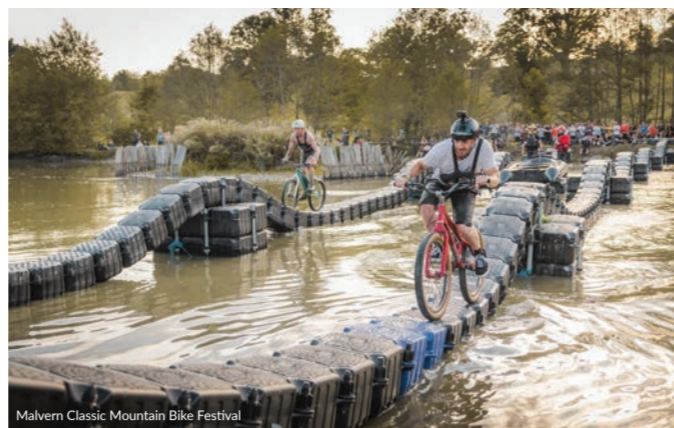
Malvern Classic Mountain Bike Festival