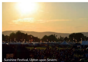
Sunshine Festival, Upton upon Severn