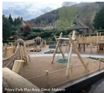
Priory Park Play Area, Great Malvern