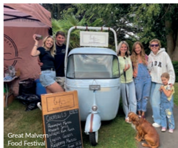
Great Malvern Food Festival