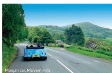
Morgan car, Malvern Hills