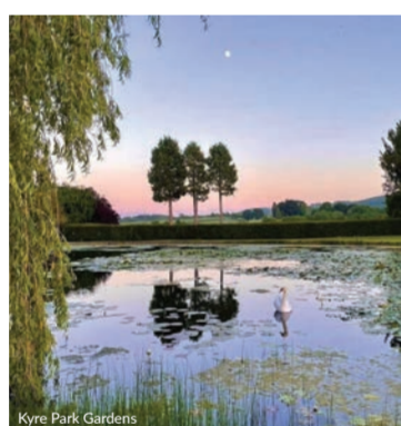
Kyre Park Gardens

Find out more about things to see and do, attractions, walking and cycling routes, festivals and events, as well as places to stay, plus much, much more on our website visithemalverns.org