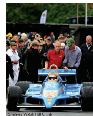
Shelsley Walsh Hill Climb