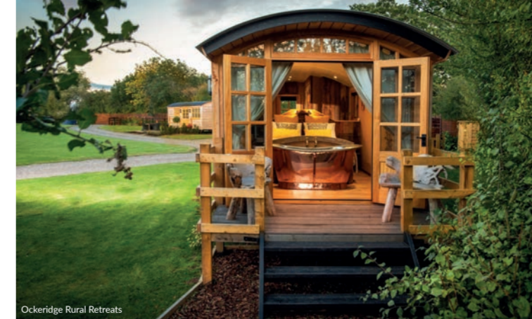
Ockenridge Rural Retreats

We have many accommodation choices that prioritise the incredible views offered by our landscape. Stay high up on the slopes of the Malvern Hills and take in the mesmerising views over the Severn Valley and across to the Welsh Black Mountains.