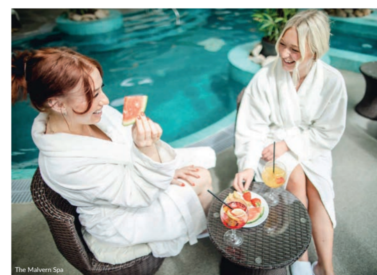
The Malvern Spa