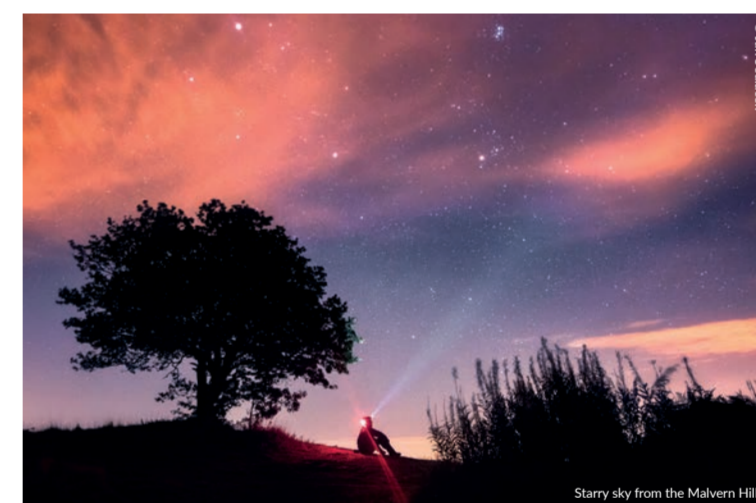
Starry sky from the Malvern Hills

Learn about our varied local history at Malvern Museum, Tenbury Museum, Tudor House Museum and Upton Heritage Centre at The 'Pepperpot'. There's ancient history too; discover Iron Age hillforts and the 700-million-year-old Martley Rock – one of the oldest rocks in the world.