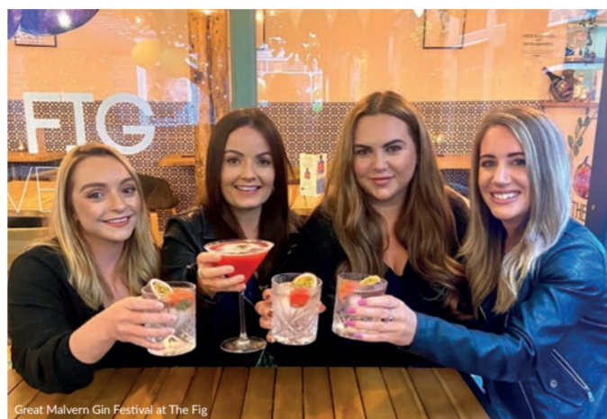
Great Malvern Gin Festival at The Fig