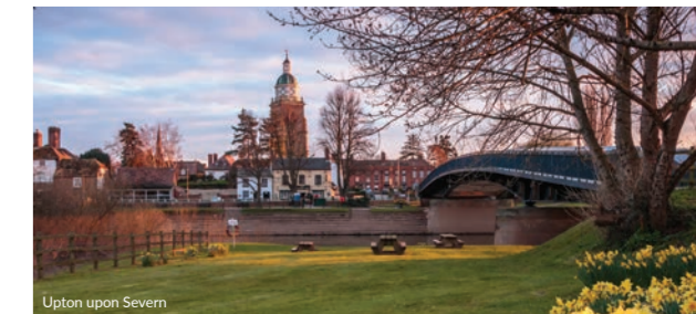
Upton upon Severn