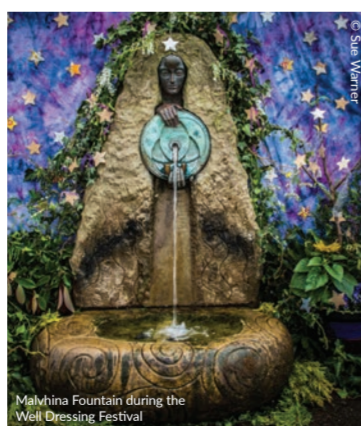
Malvhina Fountain during the Well Dressing Festival