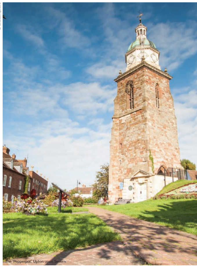
The Pepperpot, Upton upon Severn

This leaflet is available in larger print